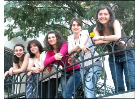
Junior Fellows 2009