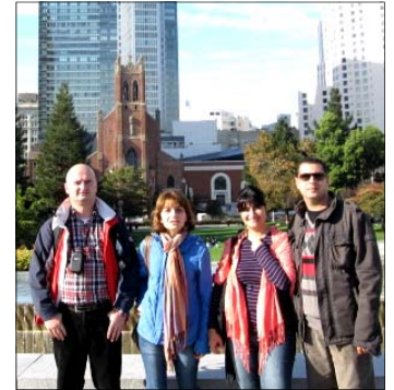
Scholars from the South Caucasus