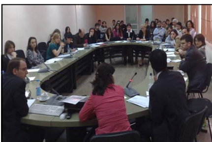
Round Table Discussion