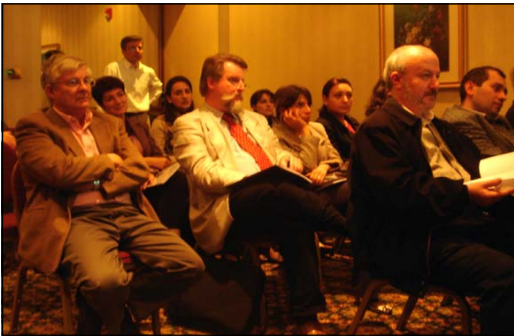
CRRC presenting at Marriott Hotel